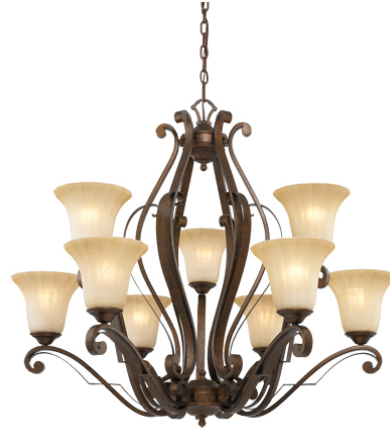
DRAWING / PHOTOS

DATE: 9/27/2011 REV DATE: 10/7/2011 ITEM #: 1089-9 RSB COLLECTION: Pemberly Court DESC.: 9LTS chandelier UPC #: 844375014398 FIX. SIZE: _____ WIDTH 35-1/2" DIA. _____ EXT. 32" HEIGHT